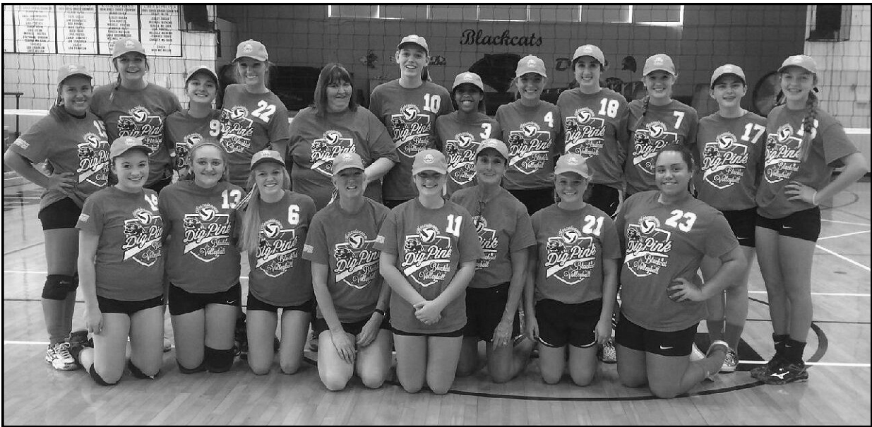
Lady Cats “dig pink”!