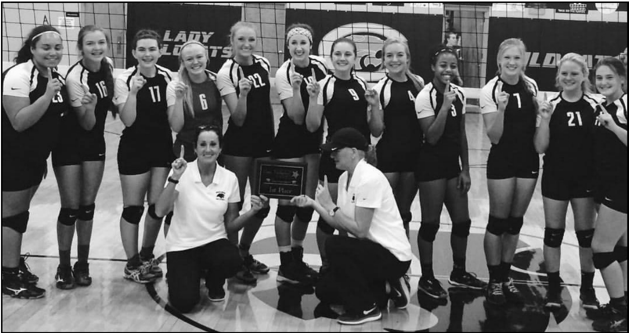
Let’s go ‘Cats!