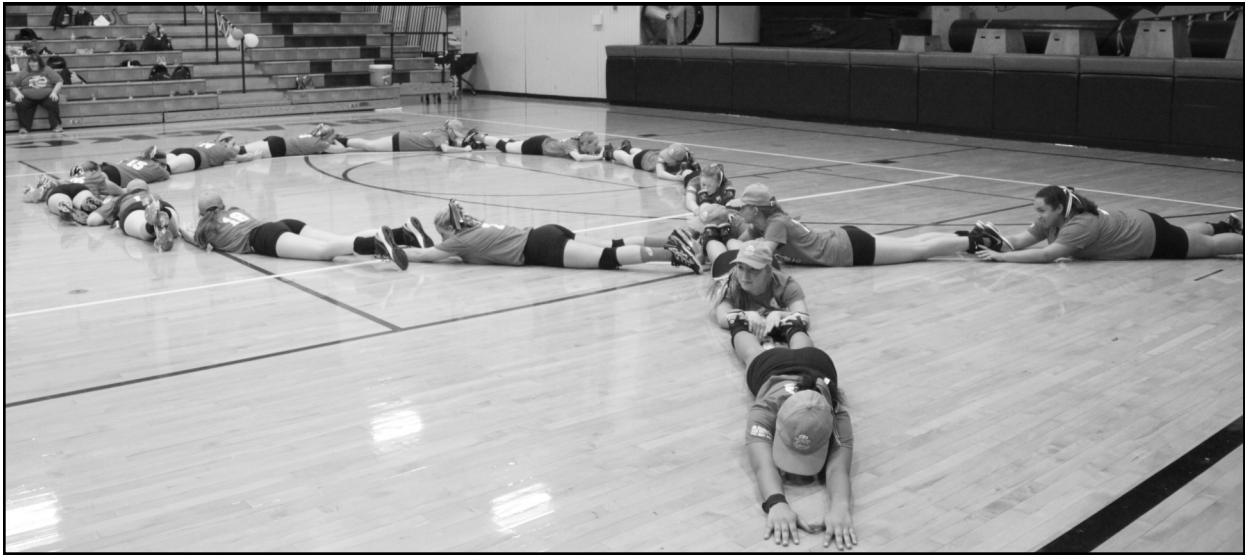
Lady Cats form a “Human Breast Cancer Ribbon” to honor those who have fought and continue to fight cancer

Hard work, Dedication and Team Play have propelled the Lady Blackcats to a successful 2015 season. The Lady Cats earned their first tournament title in the past ten years at the Cuba Tournament played in September, beating Viburnum for the championship!